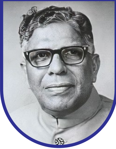
Justice K S Hegde